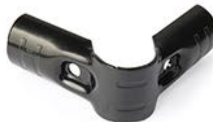
H-3 (Ungrip Type)