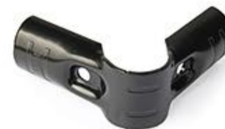
H-3 (Ungrip Type)