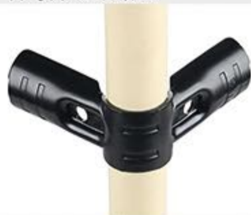
H-3K (Grip Type)